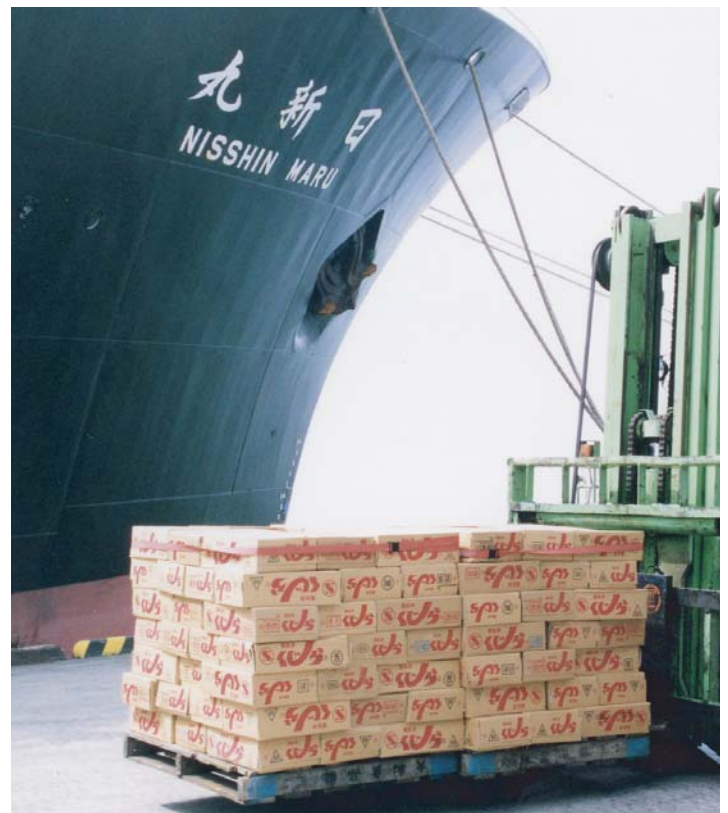
Image: The Japanese whaling fleet unloads boxes of whale meat in Ishinomaki, Japan, following its “scientific” whaling trip to the Southern ocean whale sanctuary.