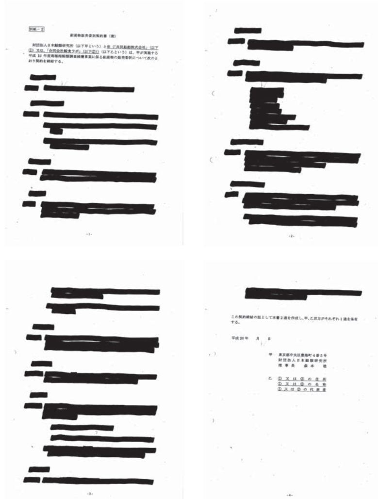
Image: The Consignment Sales Contract between ICR and Kyodo Senpaku is also so heavily edited it contains virtually no information.